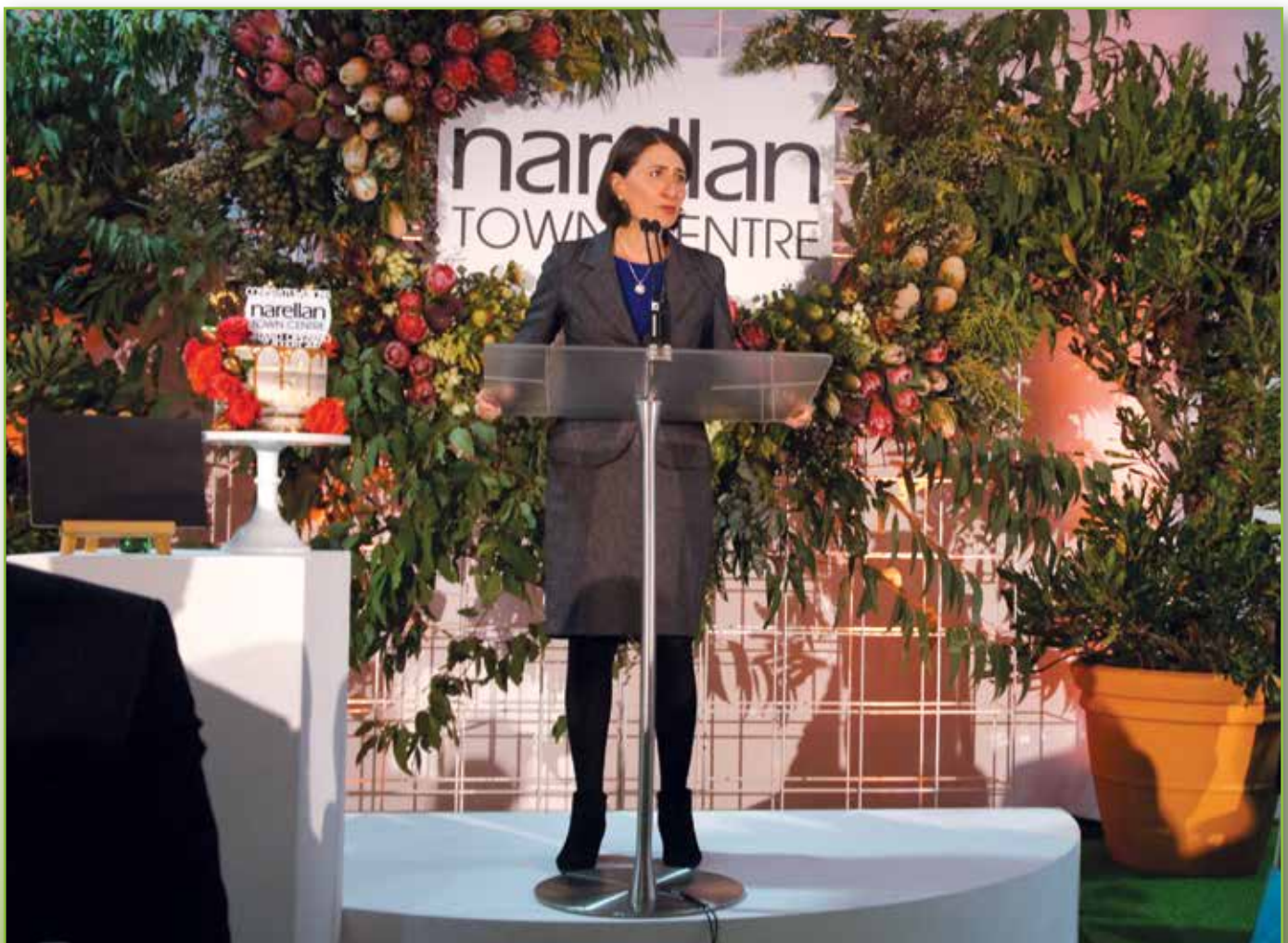
Photo: NSW Premier the Hon Gladys Berejiklian MP opening the centre

NSW Premier, the Hon Gladys Berejiklian MP opened the much anticipated expansion of the Narellan Town Centre. The $200 million expansion has extended the shopping centre to 70,000sqm of retail, dining and banking precinct. 70 new stores have now opened making the town centre a major shopping precinct reaching customers as far as Penrith, Southern Highlands and Wollongong. The new expansion has also provided many new employment opportunities. Since 1995 when the first stage of the centre was built only 40,000 people lived in the Camden Local Government Area (LGA) and now 22 years later, with the major growth in the Camden LGA, we have a world class facility in our LGA.