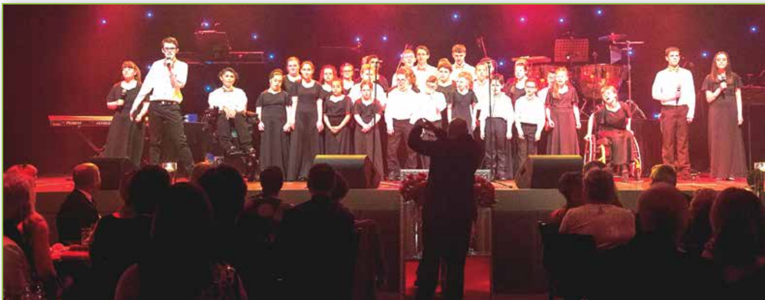
Photo: Mater Dei Choir

I recently attended the annual Mater Dei fundraising dinner. Once again, the event was a major success. All money raised goes towards the school to enable them to equip the students with skills to help transition them from school to become participating community members. Last year, with the assistance of the local community, the school was able to establish a Specialist Food Technology program. This year, the funds will go towards work place programs and specific job skills training. The generosity of the Macarthur community has contributed to the Mater Dei School being able to give all their students a balanced education and to give them the best possible start in life.