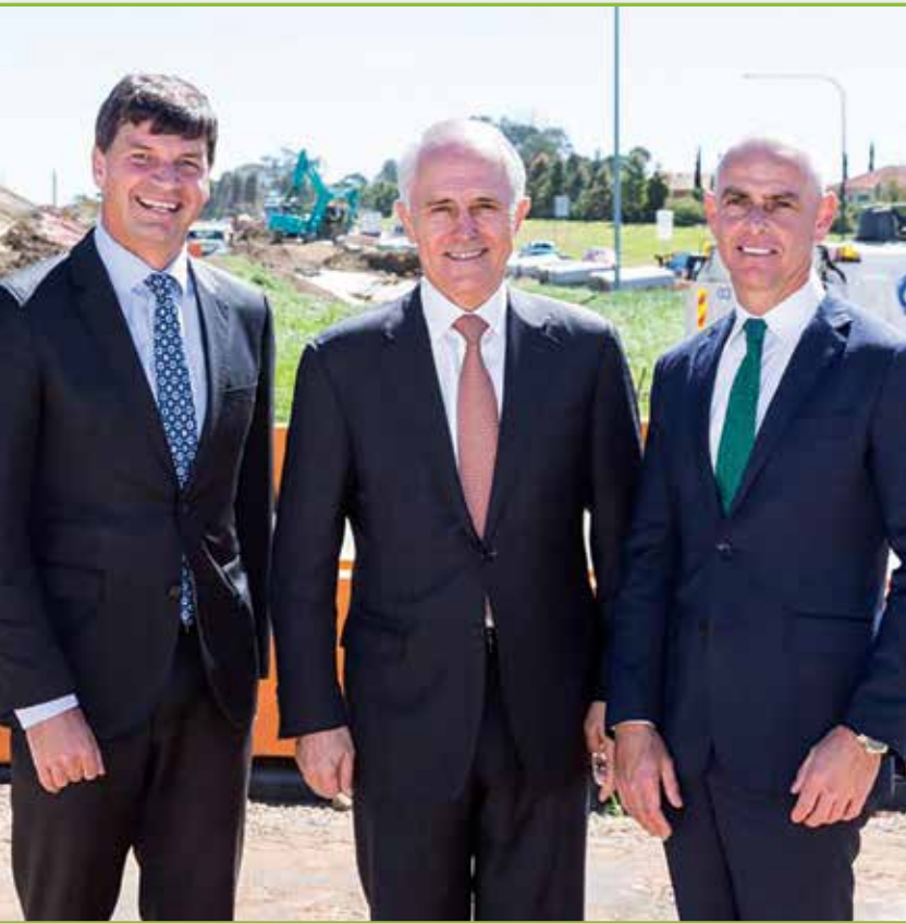
Photo: Member for Hume the Hon Angus Taylor MP Minister for Cities and Digital Transformation, Prime Minister the Hon Malcolm Turnbull MP and Chris

Prime Minister the Hon Malcolm Turnbull MP has provided an update on the $3.6 billion road infrastructure in Western Sydney. The $1.6 billion upgrade of The Northern Road will include major upgrades at the intersections of Fairwater Drive, Hillside Drive and Cobbitty Road including the installation of traffic lights. The project will be part of the infrastructure required for the proposed Badgerys Creek Airport. Further upgrades, as part of the package, will include Bringelly Road and the M12 Motorway. Further information can be found on www.rms.nsw.gov.au/projects .