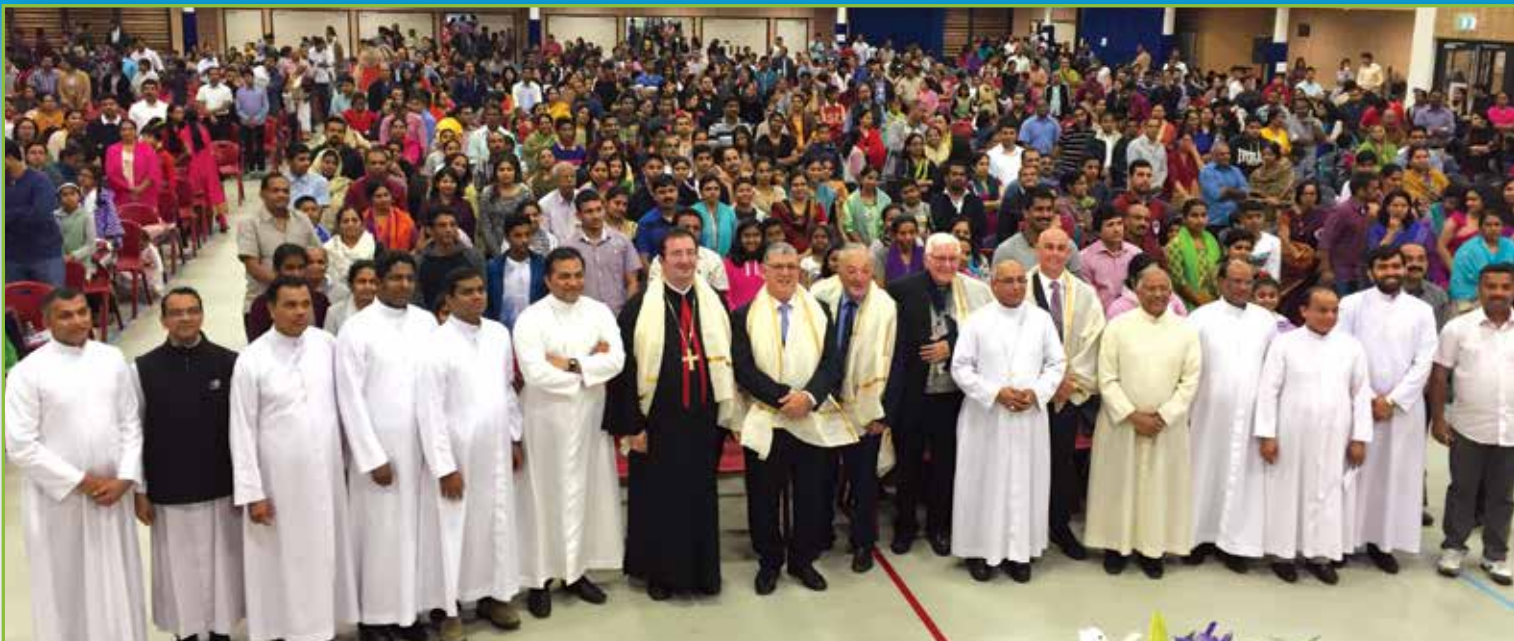
Photo: Gathering of the Syro Malabar Catholic Diocese