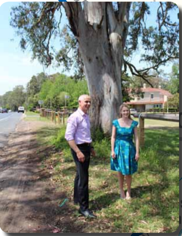
LIRS Funding $ 3,900,000 - Photo: Chris with Mayor of Camden Cr Lara Symkowiak